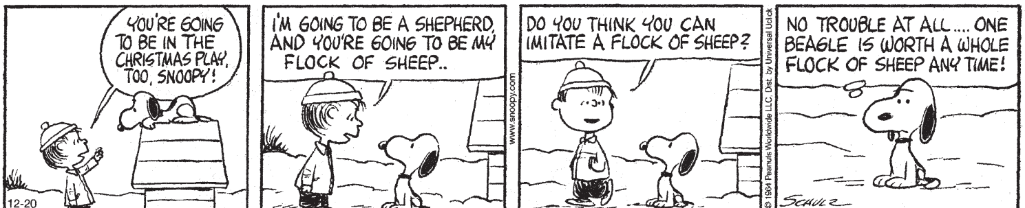
© Peanuts Worldwide. Visit the cartoon archive at www.gocomics.com